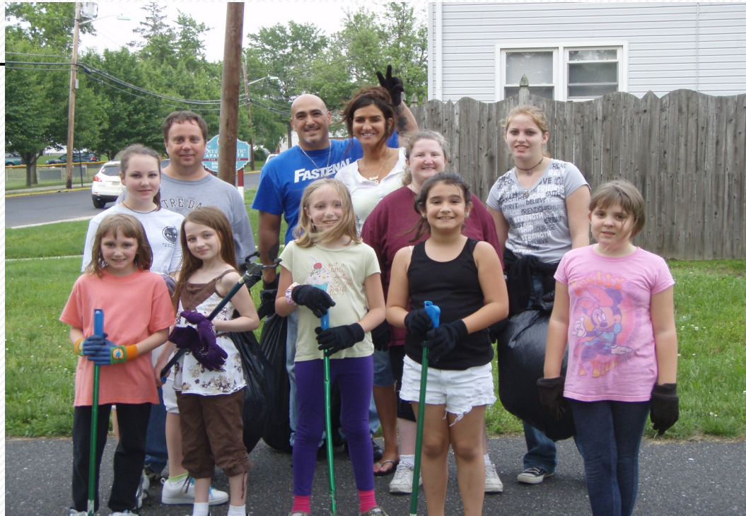
Clean Communities volunteers preparing to clean Bike Path

The purpose of this web page is to provide information concerning all of the services provided by the Department of Public Works.